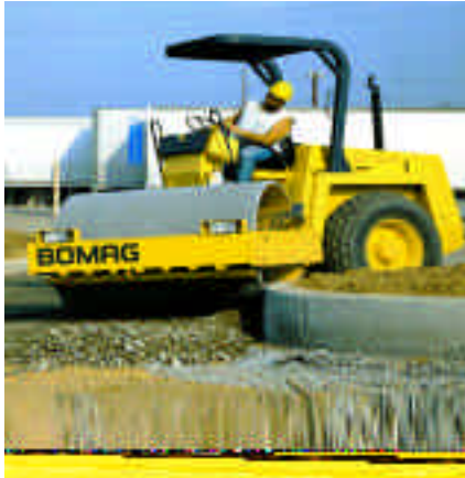
BW172D-2 – proven compaction performance for medium-sized projects