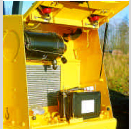
Centralized location of components