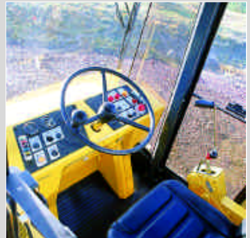
Excellent all-round visibility and ergonomic layout