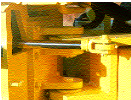
Bolt-on oscillating, articulation joint for long life and servicing ease