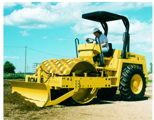
BW172PDB-2 provides maximum compaction performance on medium-sized projects