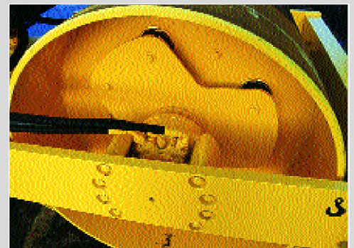
Efficient direct drum drive

With these features and many more, it's easy to see why these models maintain a high residual value while delivering lower lifetime operating costs.