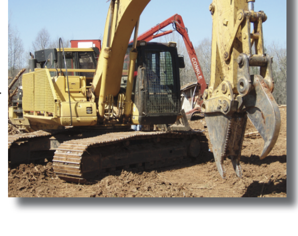
MWS 40 Model

Mobile Wood Shear Operation - The LaBounty Mobile Wood Shear replaces the bucket of an excavator and operates with the same controls, meaning no additional hydraulics are required. The bucket dump control operates the MWS open and bucket curl operates the MWS close. Please see the illustration below.