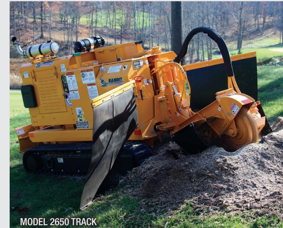
MODEL 2650 TRACK

Available with a 122-HP Tier 4 diesel, 165-HP gas V8 power and belt drive, the Model 3100 is high-production, cost-effective stump grinding powerhouse.