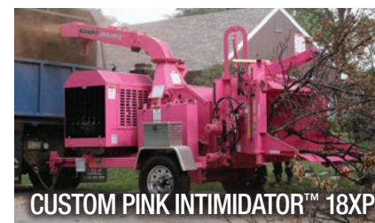
CUSTOM PINK INTIMIDATOR™ 18XP