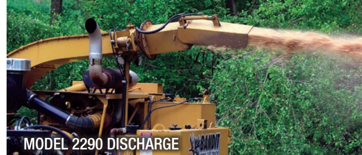
MODEL 2290 DISCHARGE