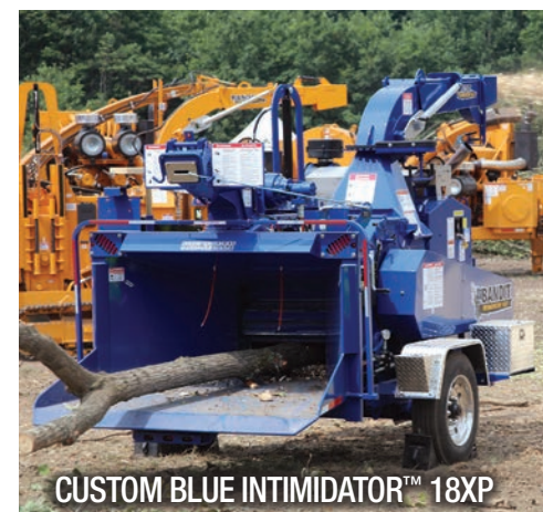
CUSTOM BLUE INTIMIDATOR™ 18XP