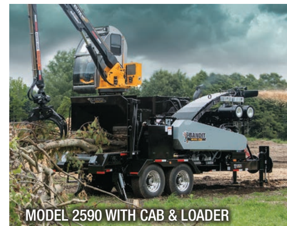
MODEL 2590 WITH CAB & LOADER