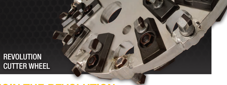
REVOLUTION CUTTER WHEEL