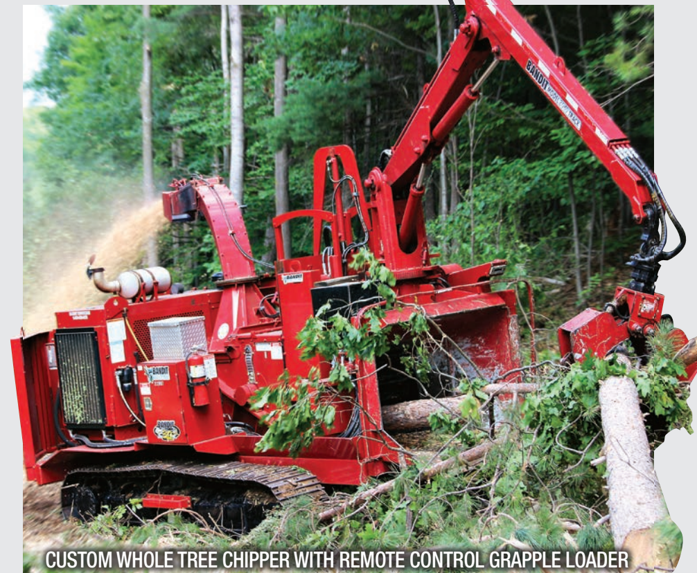
CUSTOM WHOLE TREE CHIPPER WITH REMOTE CONTROL GRAPPLE LOADER

Model 490XP 4" Capacity 18 HP and PTO option