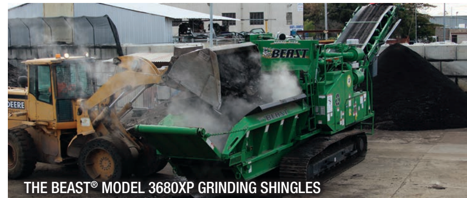
THE BEAST® MODEL 3680XP GRINDING SHINGLES