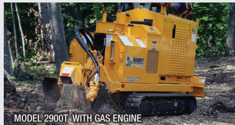
MODEL 2900T WITH GAS ENGINE

Convenience items such as wireless remote control and grading blades are available on most Bandit stump grinders. Gasoline or diesel engines are also available, ranging from 25- to 165-horsepower.