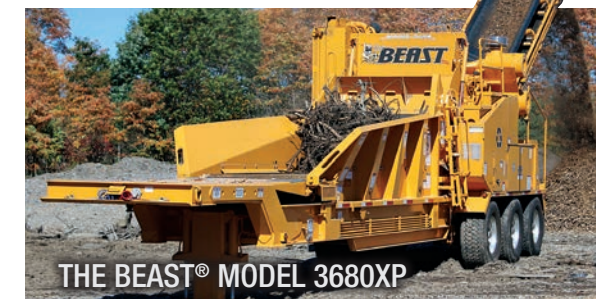
THE BEAST® MODEL 3680XP

With numerous tooth and screen options to choose from, The Beast can easily serve a variety of markets. Produce high-quality mulch from waste wood, then switch to knives to produce screened wood chips. Equipped with the shingle grinding package, The Beast can recycle shingles for hot-mix asphalt supplement. Install an optional colorizer and produce colored landscape mulch.