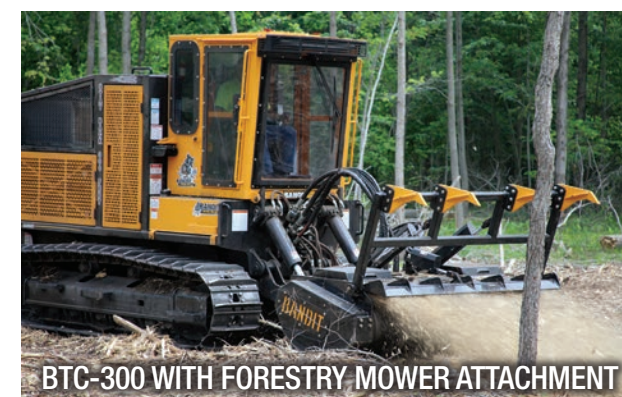
BTC-300 WITH FORESTRY MOWER ATTACHMENT

Whether clearing acres of trees or fields of stumps, the BTC-300 can handle it with newly designed mowing and stump grinding attachments. The forestry mower features a very wide 90-inch cut and can easily take down small-to-medium sized trees. A new float feature helps the mower head ride at ground level without digging in. A patent-pending tooth and holder design aggressively processes trees, limbs and brush, mulching it all directly into the ground. The stump grinding head features a 44-inch diameter grinding wheel with a deeper reach, and it offers 30% more torque than previous models for quick efficient grinding. Switching between the attachments is extremely easy, taking less than 10 minutes in the field.