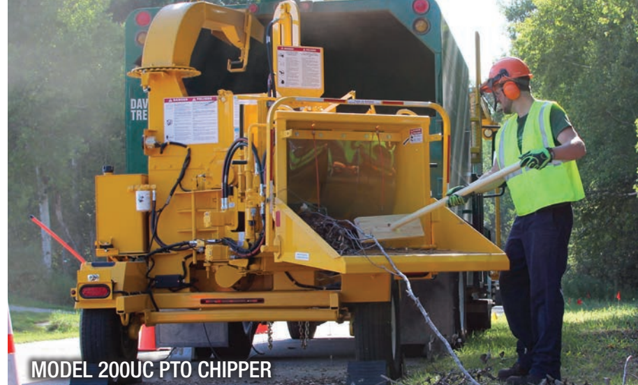
MODEL 200UC PTO CHIPPER