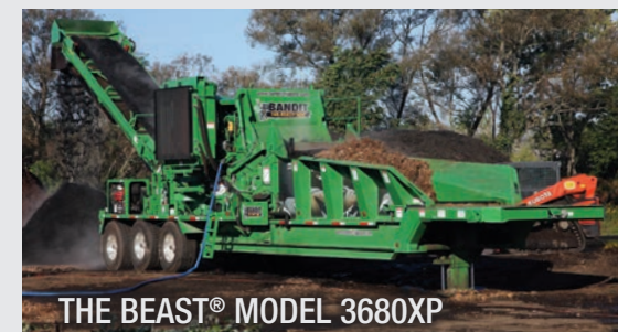
THE BEAST® MODEL 3680XP