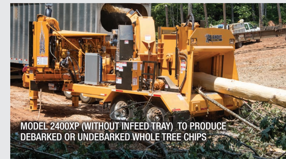
MODEL 2400XP (WITHOUT INFEED TRAY) TO PRODUCE DEBARKED OR UNDEBARKED WHOLE TREE CHIPS

Because Bandit machines are built by specialized teams and not on an assembly line, incorporating custom designs to fit unique needs is not a problem! Contact Bandit to learn more about customized equipment.