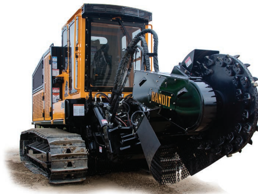
BTC-300 WITH STUMP GRINDER ATTACHMENT

The BTC-300 is a completely new track carrier from Bandit Industries. From its redesigned deluxe operator's cab with its outstanding visibility, lower ground pressure, and numerous mechanical updates and Tier 4 engine power, the BTC-300 delivers exceptional land clearing performance with exceptional reliability and class-leading levels of comfort. Built from extensive customer feedback and over a decade of experience with track carriers in high-production land clearing environments, the BTC-300 further builds on Bandit's vision for a high-performance, all-terrain mowing and stump grinding machine.