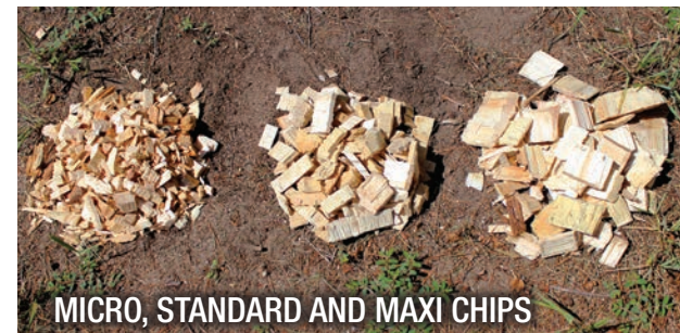
MICRO, STANDARD AND MAXI CHIPS