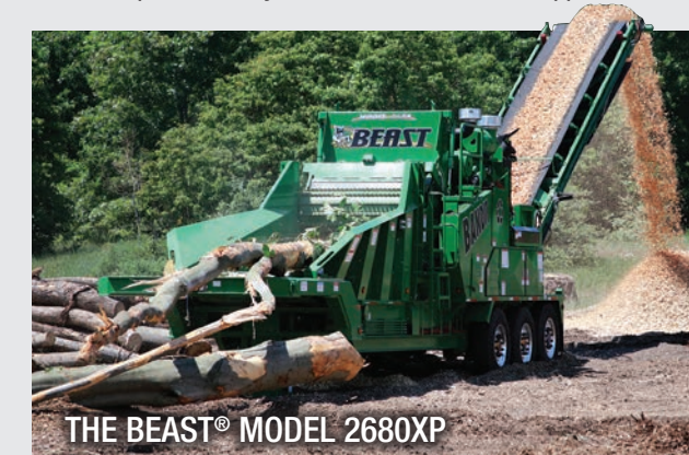
THE BEAST® MODEL 2680XP

More than 30 enhancements to The Beast line in 2015 have increased production by as much as 50% in most applications.