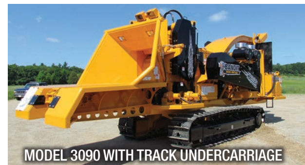
MODEL 3090 WITH TRACK UNDERCARRIAGE

Bandit introduced the industry's first self-propelled track whole tree chipper in 1991. Today, industry-proven CAT® steel-track undercarriages are available on every Bandit whole tree chipper, giving these machines all-terrain capability to serve a range of specialty clearing applications such as power line maintenance, oil/gas exploration or new road construction. Self-propelled units are also great for logging operations, making it easier to position the chipper on the landing. Operated via wireless remote, a single operator in a loader can control all chipper functions.