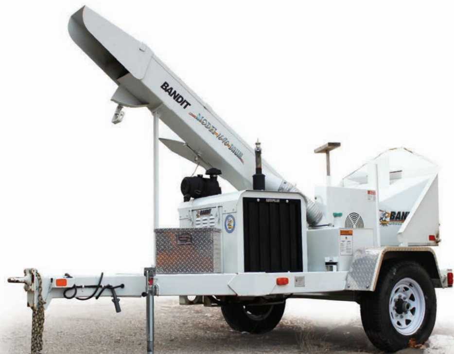
MODEL 1690 CONVENTIONAL DRUM CHIPPER

Still popular with utility line crews and maintenance companies with large fleets, this low-maintenance chipper forgoes a feed system. Material is pulled in directly by the 16" diameter four-knife chipping drum and features a 10" by 16" throat opening. Chips exit through a stationary discharge, with an auxiliary side discharge optional.