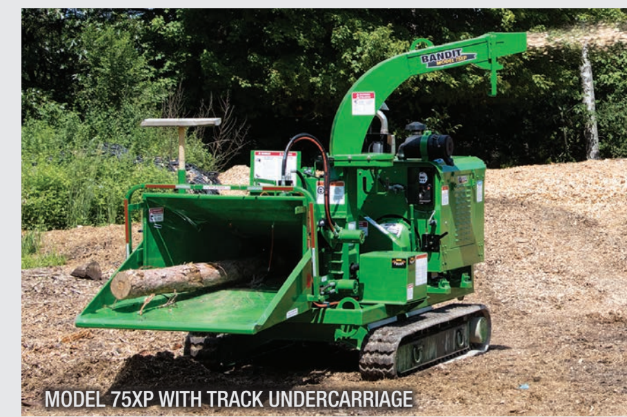
MODEL 75XP WITH TRACK UNDERCARRIAGE

Expect significantly less maintenance and downtime with a Bandit hand-fed chipper. Heavy-duty materials and components with solid welded construction help these machines withstand the daily rigors of chipping. It's not uncommon for a Bandit hand-fed chipper to be on front-line duty for more than 10 years and 10,000 hours.