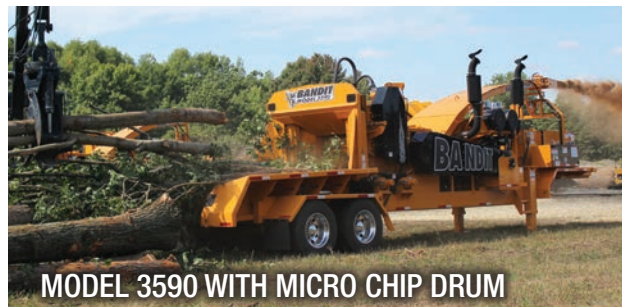
MODEL 3590 WITH MICRO CHIP DRUM

Bandit whole tree chippers are built incredibly strong, utilizing extensive welded assembly with large disc/drum shafts and thoroughly reinforced chipping drums. That's why every new Bandit whole tree chipper is backed by a five-year GUTS warranty that covers the Bandit-fabricated disc/drum assembly and the Slide Box Feed System. Contact Bandit for warranty details.