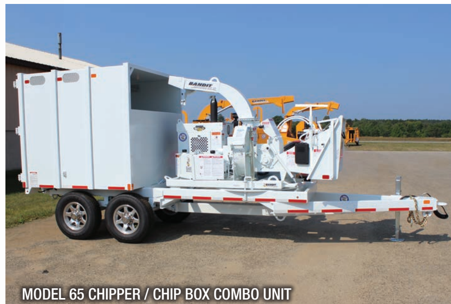
MODEL 65 CHIPPER / CHIP BOX COMBO UNIT

PTO-powered chippers are ideal for orchards, farms or estates where tractors or other PTO-capable vehicles are already in-use for grounds maintenance. PTO chippers are available as towable or tractor-mount with a three-point hitch. New 9" and 12" PTO chipper options are driven via PTO shaft from a chip truck, and are available with either a rear or curb-side feed.