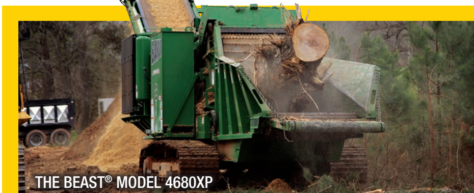
THE BEAST® MODEL 4680XP

ACHIEVE MULCH PRODUCTION RATES OF 800 YARDS/HOUR with the Model 4680XP. With a 45" capacity and engines up to 1,200 horsepower, it's the largest horizontal grinder in The Beast line.