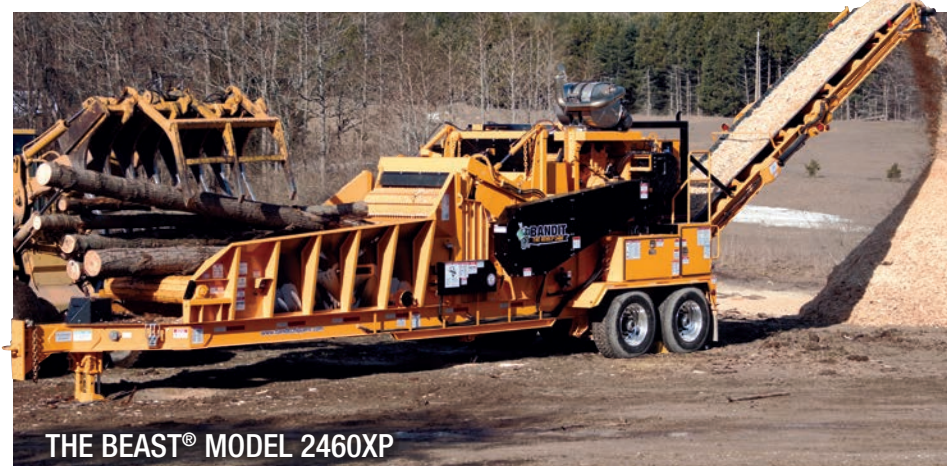
THE BEAST® MODEL 2460XP

The 2460XP will out perform all other grinders in its size class. The 2460XP is equipped with a 60" wide by 30" diameter cuttermill, a 60" wide by 24" mill opening. This machine uses a 30-tooth cuttermill running Bandit's patented saw-tooth style cutterbodies that regulate the size of the tooth's bite. Most of the material is sized in the initial cut, so material exits the large screening area quicker.