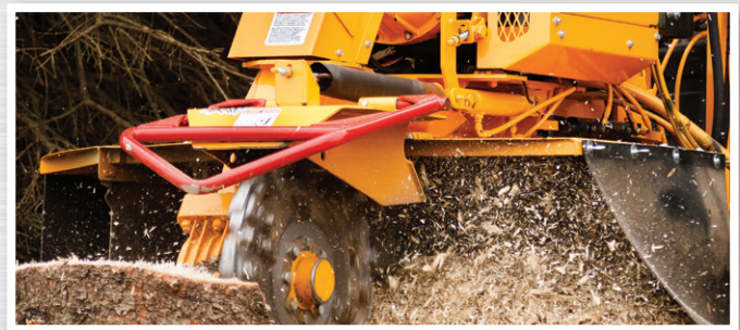
CHIP CONTAINMENT AREA