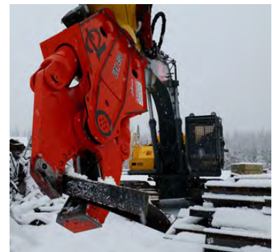
UPX 450 WITH SHEAR JAWS

CLICK HERE TO WATCH VIDEO OF UPX JAW SWAP