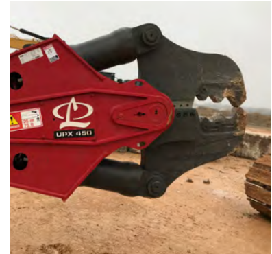
UPX 450 WITH CONCRETE CRACKING JAWS

NOTE: The UPX950 Concrete Cracking jaw is designed without Swift Lock Teeth and instead features weld-in replaceable teeth.