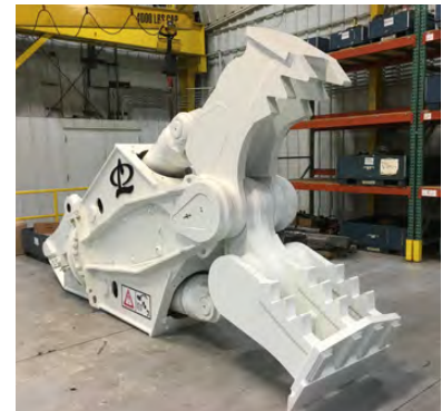
UPX 950 WITH CONCRETE PULVERIZER JAWS

NOTE: The UPX950 and UPX750 Concrete Cracking jaw are designed with weld-in replaceable teeth, which eliminates the need for Swift Lock Teeth. However, the UPX450 CC jaw, being the largest, features Swift Lock Teeth.