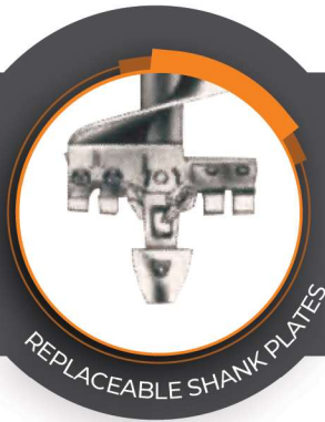
REPLACEABLE SHANK PLATES