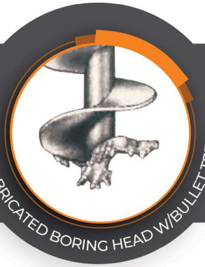
FABRICATED BORING HEAD W/BULLET TEETH