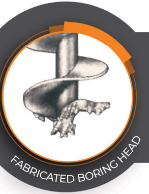
FABRICATED BORING HEAD