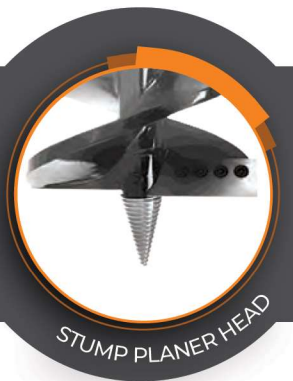
STUMP PLANER HEAD