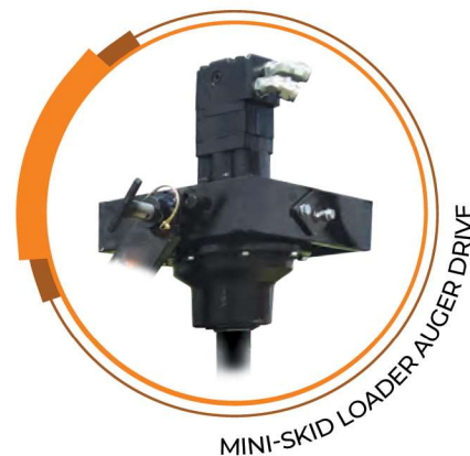
MINI-SKID LOADER AUGER DRIVE