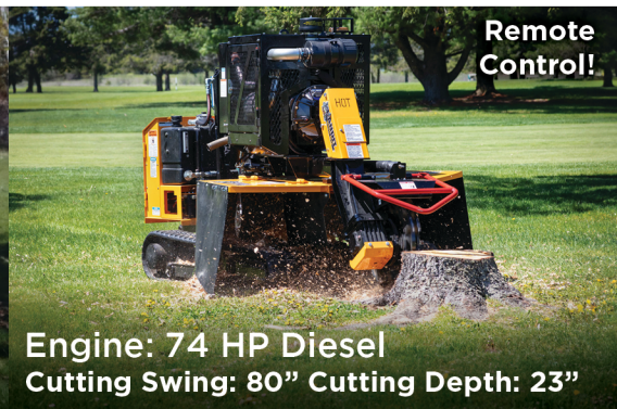
Engine: 74 HP Diesel Cutting Swing: 80" Cutting Depth: 23"