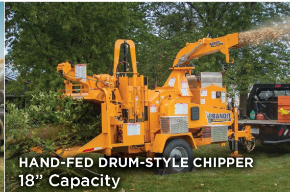
HAND-FED DRUM-STYLE CHIPPER 18" Capacity