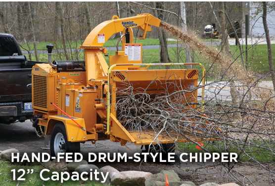
HAND-FED DRUM-STYLE CHIPPER 12" Capacity