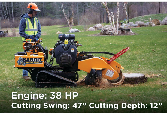
Engine: 38 HP Cutting Swing: 47" Cutting Depth: 12"