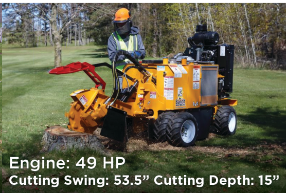
Engine: 49 HP Cutting Swing: 53.5" Cutting Depth: 15"