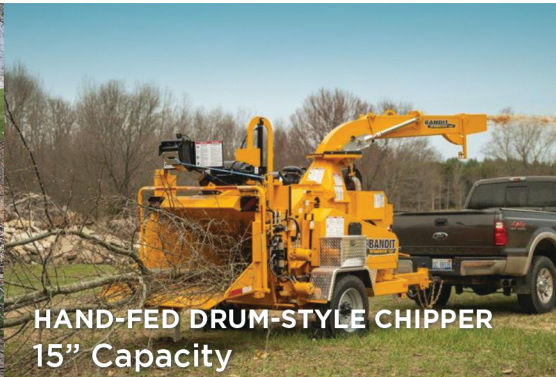
HAND-FED DRUM-STYLE CHIPPER 15" Capacity